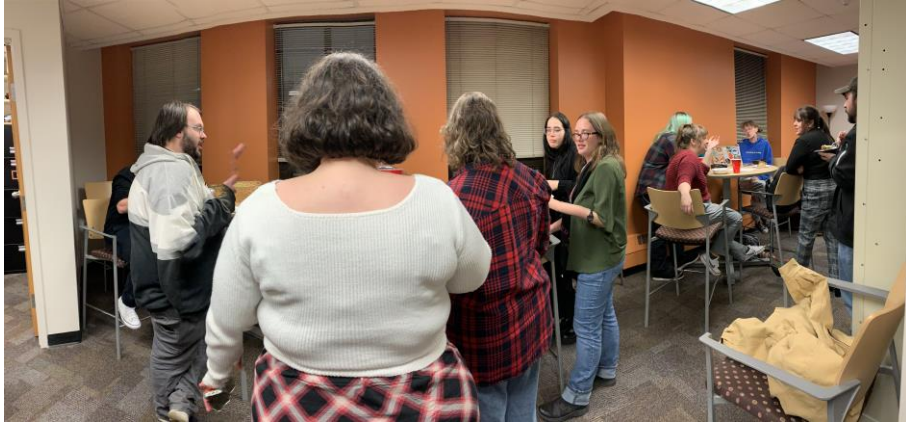
November First Thursday meeting