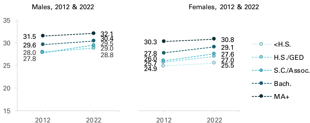
Figure 3. Median Age at First Marriage by Educational Attainment for Males and Females, 2012 & 2022