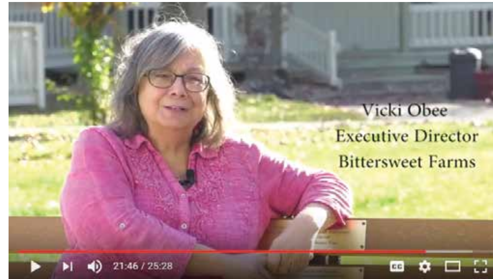
A still from “Faces for Autism”