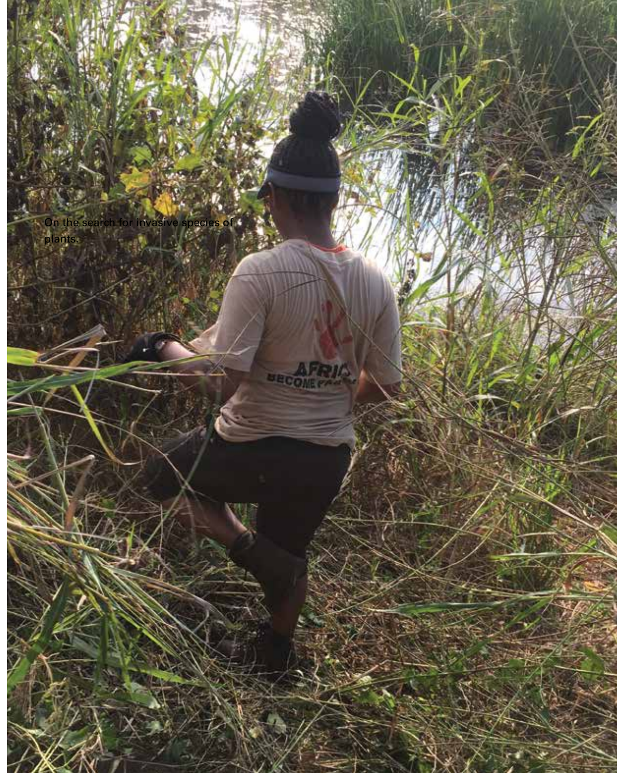
On the search for invasive species of plants.