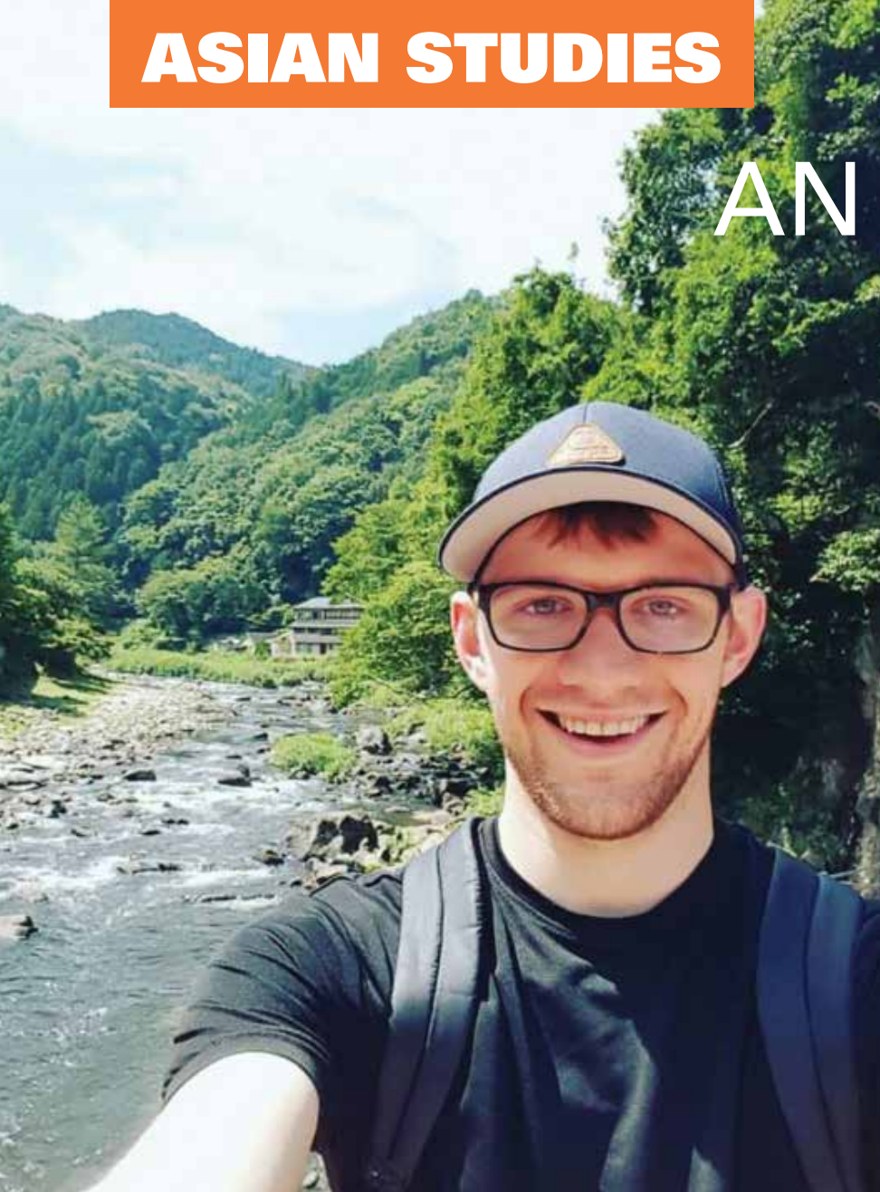
The small mountain town of Asuke is a scenic place for a hike.