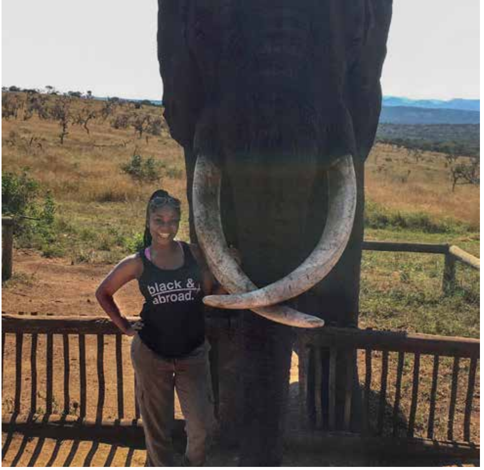
Rambo is an ambassador for elephant conservation.

"Public health is everything I want to do in my career," she said. "There are so many different aspects to the environment; it's much more than plants and wildlife." Advocacy, in particular, factors heavily in her interests, and she would eventually like to work for an international organization such as the World Health Organization or the United Nations.