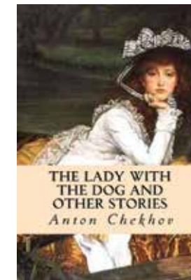
"The Lady with the Dog" is the story of an adulterous affair between a Russian banker and a young woman.

"We enter the text of a story into the software, then sort and filter it to extract all the words," Emerson said. "Then we use tools to make word clouds and frequency graphs and dispersion plots."