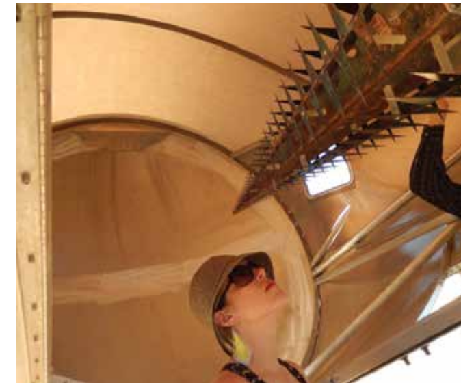
Up in the business end of an Allen telescope.

“Some stars pulse so regularly and so brightly that we can use them as distance markers in astronomy,” she said. “It’s important to catalog these, and we were able to confirm seven new variable stars in Globular Cluster 30.”