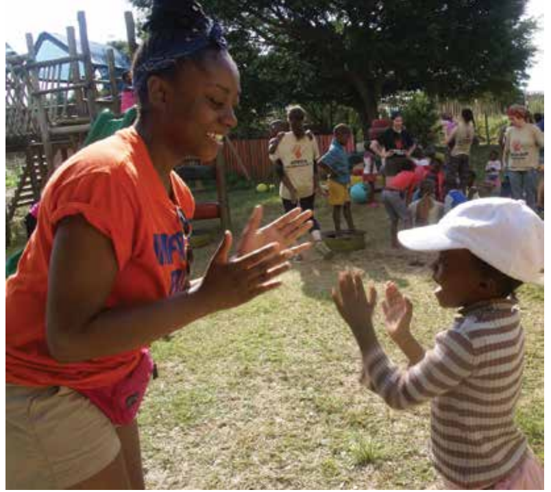
Children at the South African orphanage love interacting with the volunteers.

Her project this summer as a Ronald E. McNair research scholar centered on how environmental issues cause health disparities in low-income communities of color. She conducted interviews with community members, professionals in the environmental field and the health industry and, combined with census data, presented her findings at the annual McNair conference in Buffalo.