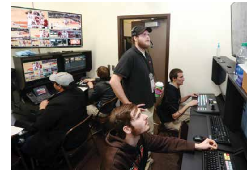
Off camera: Students work behind the scenes to produce the live show.