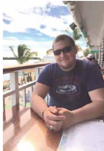
His scuba experience, together with the research skills he developed en route to getting his bachelor's and master's degrees in history at BGSU, were good preparation for his next adventure: the master's program in underwater archaeology at the University of Miami (Florida), starting fall 2017.

The series "Pirates & Profiteers: The Quest for the Mother Lode" premieres September 2017 on the History Channel.