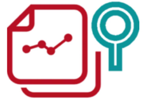
Data & Research