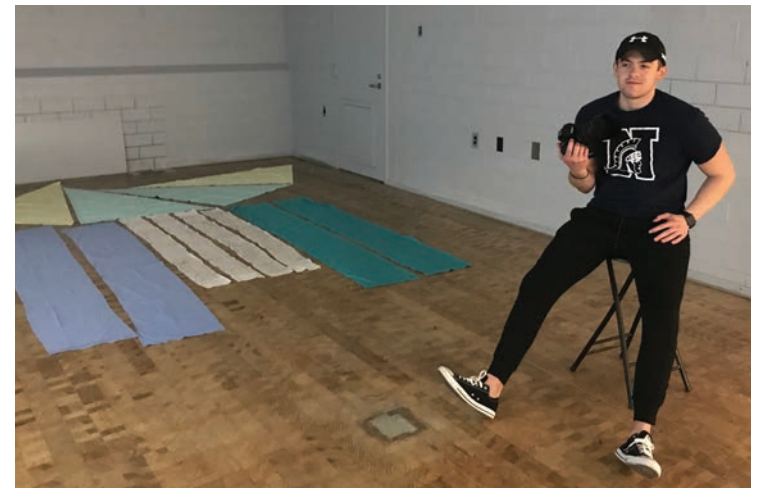
Trevor Goebel documents the installation.