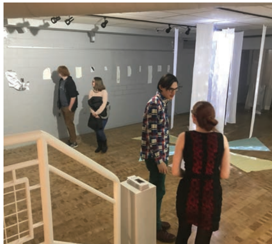
Students prepare to install "Harbor: Material Thinking" as one of the inaugural exhibitions in the Red Door Gallery at the Fine Arts Center.