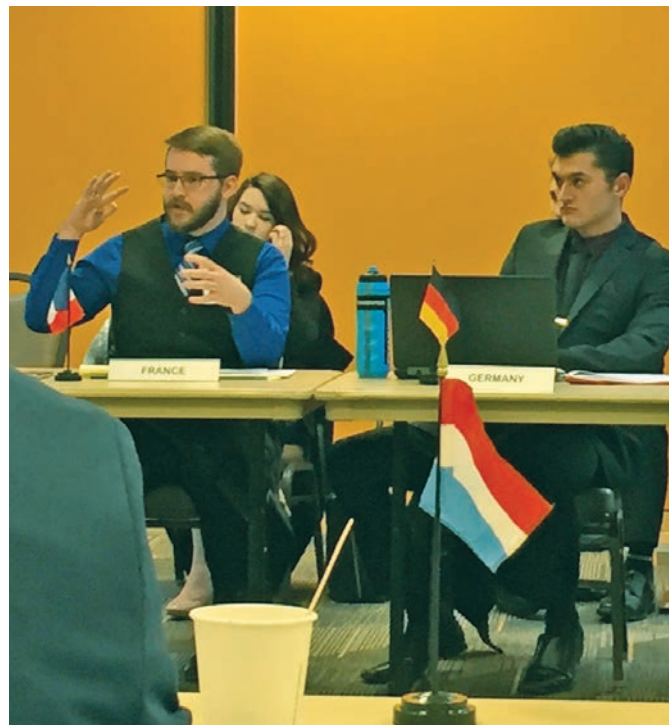
The France representative makes a point during the morning debates of the Model European Union competition held at BGSU.

These opportunities contribute to the success BGSU political science students achieve after graduating. They are prepared to be leaders in the world, whether they choose to pursue graduate study, law school and public services or careers in public, private, nonprofit sectors, and global, national, state and local politics.