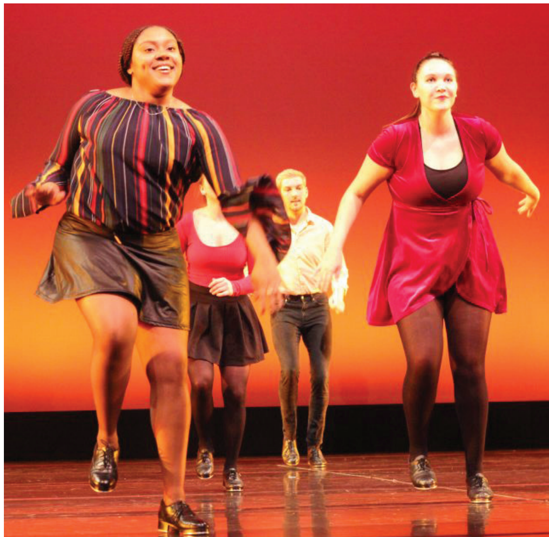
The Department of Theatre and Film welcomes the Dance minor to its offerings as of fall 2019.