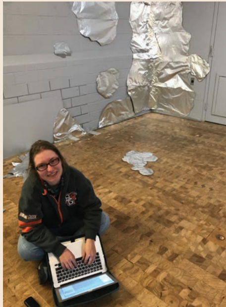
The installation process

“Harbor was an opportunity for all involved to operate in modes of expression we don’t often find time for otherwise.”