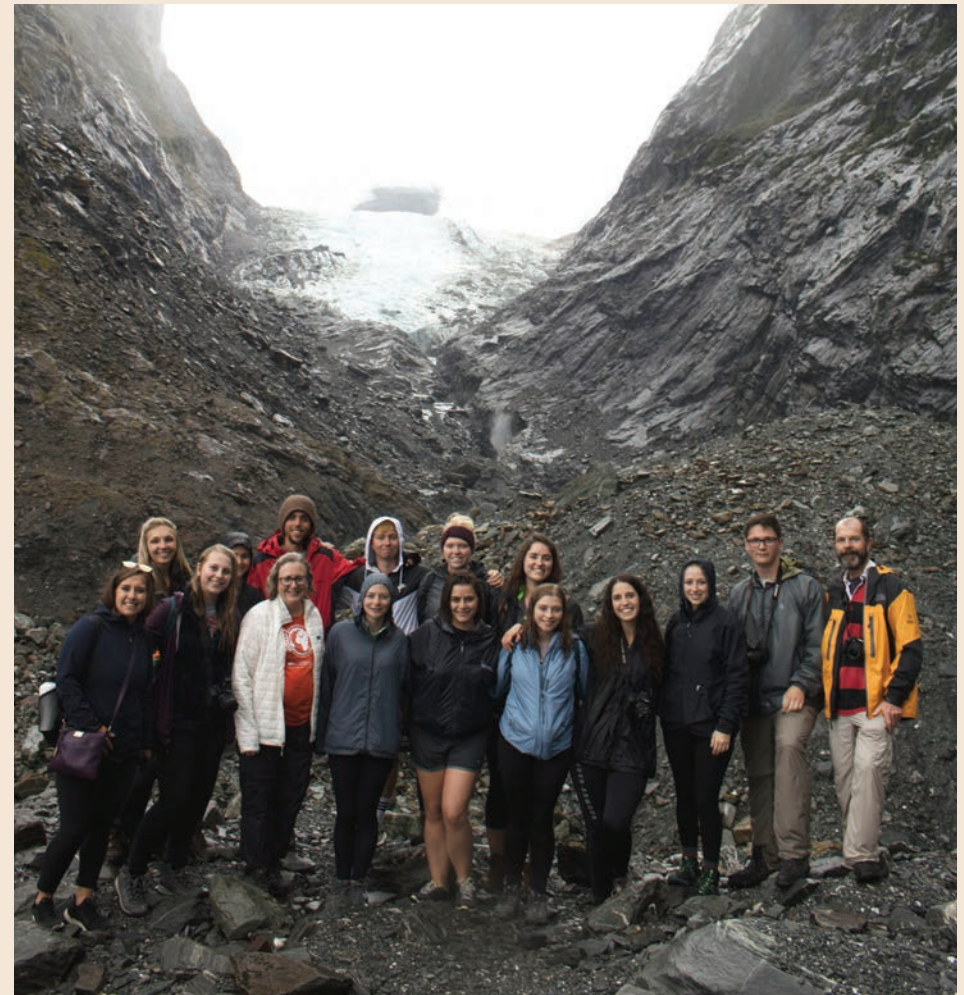
The impact of climate change was evident when the students and faculty visited the Franz Josef Glacier.