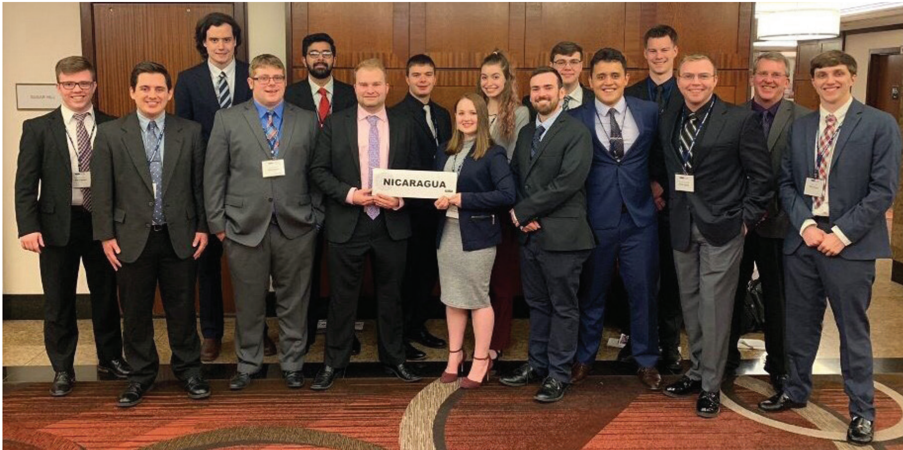
The BGSU Model United Nations team earned an honorable mention award for its representation of Nicaragua in the debate about U.N. Sustainable Development goals.