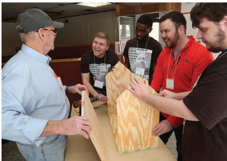
Nonprofit Management is a new minor in the Department of Political Science that prepares students to become future leaders within the nonprofit sector.

Nonprofit Management is a new minor in the Department of Political Science that prepares students to become the future leaders within the nonprofit sector. Nonprofit organizations play a vital role in the well-being and development of our society in areas such as social services, youth, environment, arts, education, culture and history, social justice, health and medical-related, international organizations, professional associations, and sports and recreation. The nonprofit curriculum is interdisciplinary and offers a combination of theory and applied skills courses, with an emphasis on experiential learning. Students also have the potential to earn a Certified Nonprofit Professional credential offered by the Nonprofit Leadership Alliance.