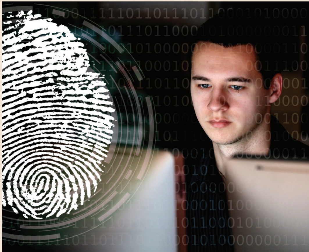
Digital Forensics is an in-demand field and BGSU's Computer Science Department offers it as a specialization.

BGSU's College of Arts and Sciences knows the importance of preparing students for careers now and in the future. While the foundation of an arts and sciences degree is to create critical thinkers, problem solvers, who are adaptable to their environments, we continue to stay current in the programs we offer and the way we integrate experiences in and out of the classroom.