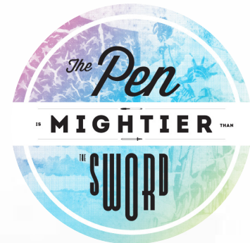
Zack Zollars, The Toledo Blade