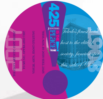
Todd Childers, Secor Building