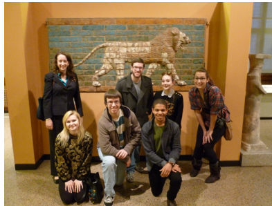
AHA at the Museum of Contemporary Art, Chicago