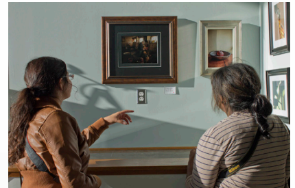
Exhibition: Reporting Back: A Survey of Documentary Photography