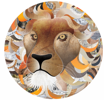
Matt Rowland, Toledo Zoo