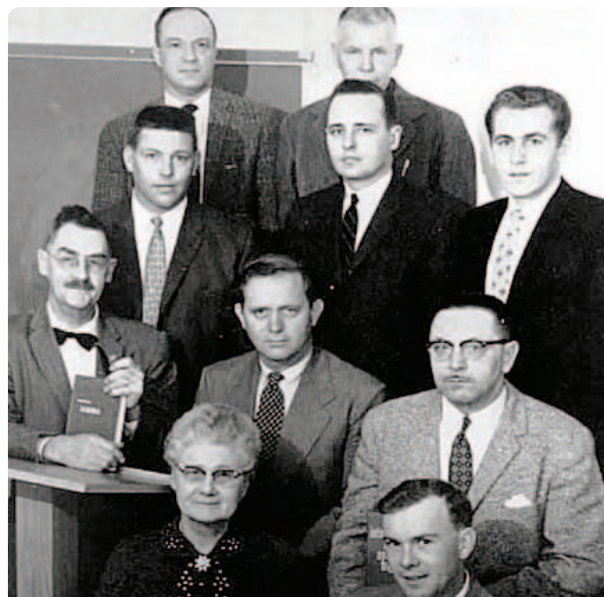
Math Department in the 1950s: