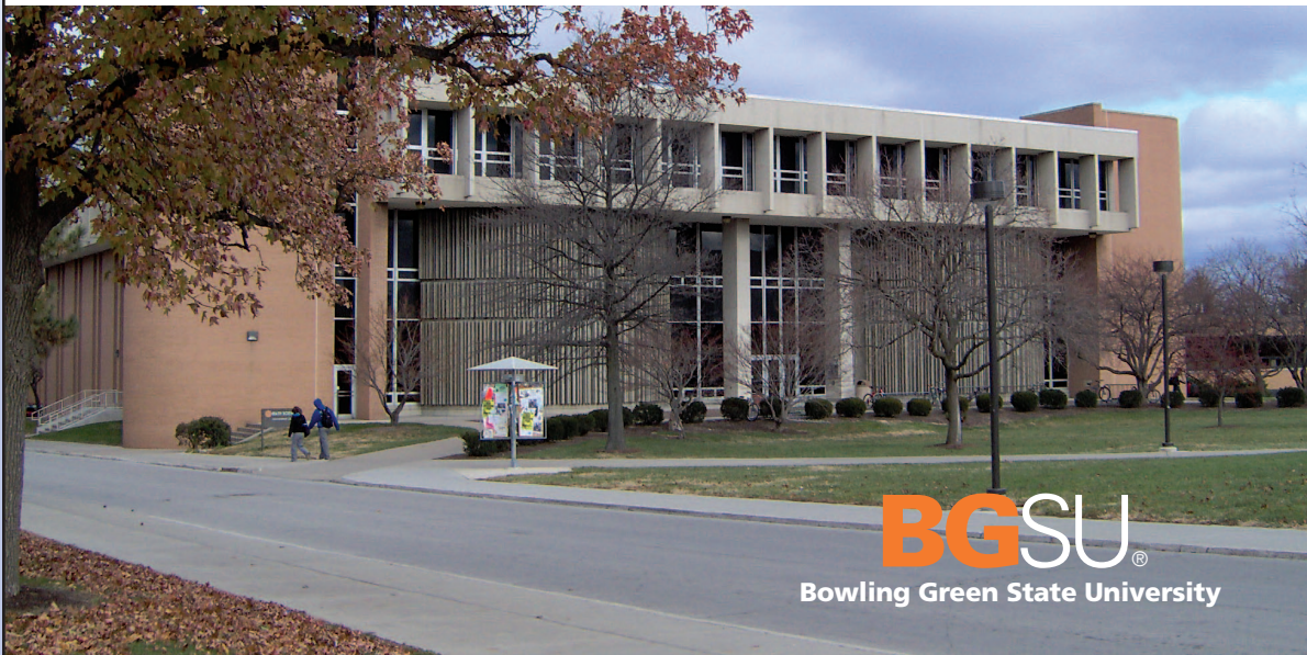
Kit Chan, Chair Department of Mathematics and Statistics

Our department is now in the process of changing the delivery of some of our foundational math courses from the traditional classroom lecture style to the new emporium style, or a hybrid of the two styles. These are courses ranging from Intermediate Algebra to Precalculus. The emporium style is designed to allow students to do their homework problems in a large computer lab, or a math emporium, with assistance from instructors who oversee the lab. In this way, the students work at their own pace to improve their math skills. When a student cannot solve a problem completely, the computer will show the student the correct method and will generate a similar problem to help them get through the concepts. At similar institutions, this approach has been proven to be a successful way of training students to achieve algebra skills. We are looking forward to having the emporium in our building, using part of the space that once housed the Ogg Science Library.